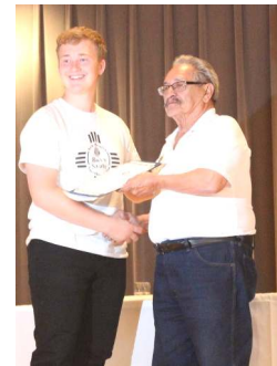
Prospero Sanchez Scholarship