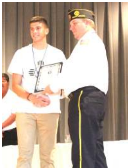
TJ Trevino Scholarship