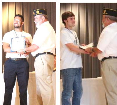
Santiago Hidalgo Scholarship