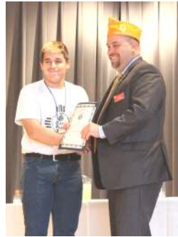
Post 72 Otero/Garcia/Navarrete Scholarship