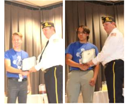
Post 7 Mudgett/Trevino Scholarship