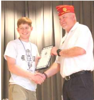
Post 13 Scholarship