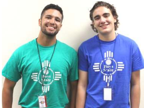
Senator Leonardo Aragon