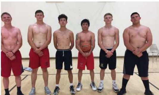
Basketball Champions Armijo 1

The Public Regulatory Commission has awarded the Electric Company's request for a twenty-five percent (25%) increase in rates for equipment replacement. The Commission believes these replacements will be beneficial to the community as a whole and necessary for protection against electrical blackouts. This request will be put into effect within the next two (2) months.