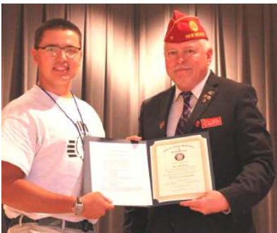
Post 13 Scholarship