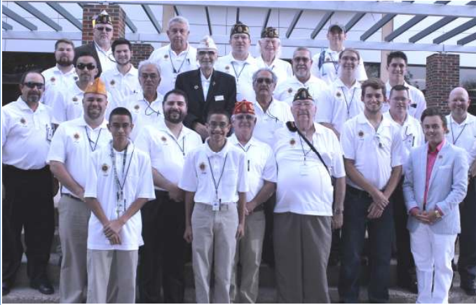
NM Boys' State Staff