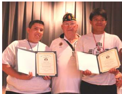
Post 118 Scholarship