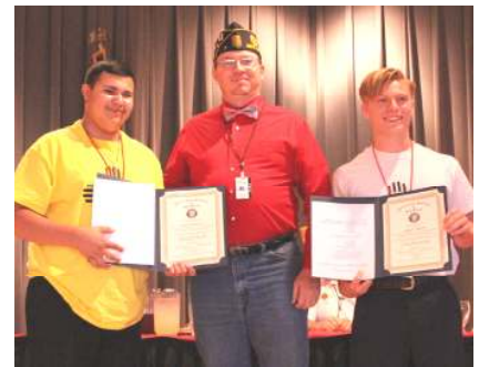
Post 7 Mudgett/Trevino Scholarship