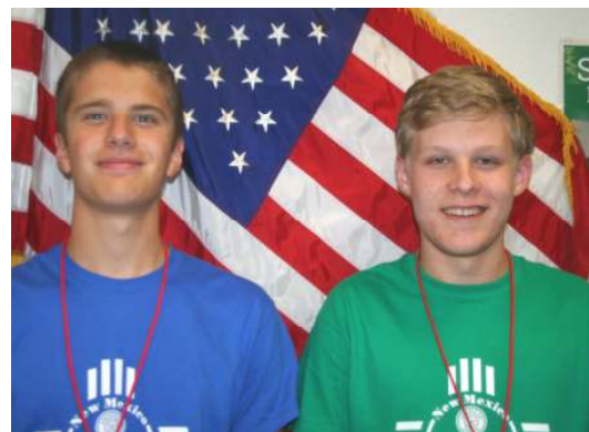
Alternate Orion Dolly-Pirrie