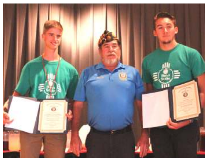
Santiago Hidalgo Scholarship