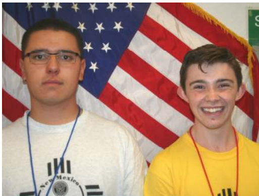
Senator Eric Howe