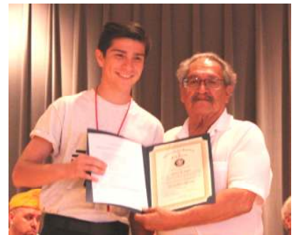
Prospero Sanchez Scholarship