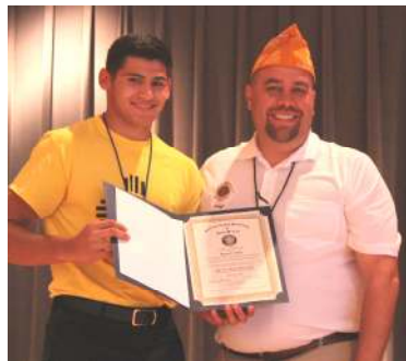
Post 72 Otero/Garcia/Navarrete Scholarship