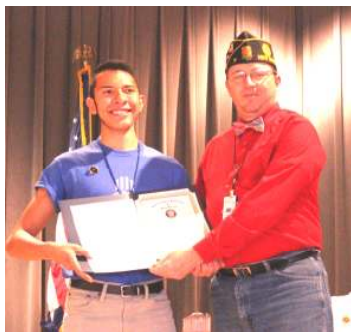
TJ Trevino Scholarship